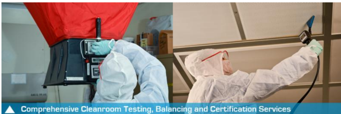
▲ Comprehensive Cleanroom Testing, Balancing and Certification Services