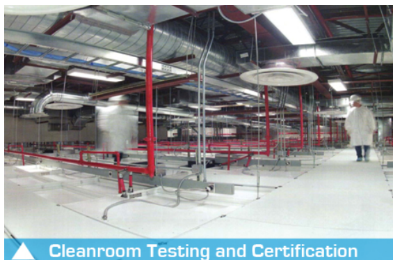
▲ Cleanroom Testing and Certification

HEPA Integrity, ISO and EU Particle Counts, Air Change Rates, Viable Environmental Sampling, Room Pressure Testing and certifications and Room Recovery Testing and certifications. As built, at rest, and operational. Pre and post construction certification.