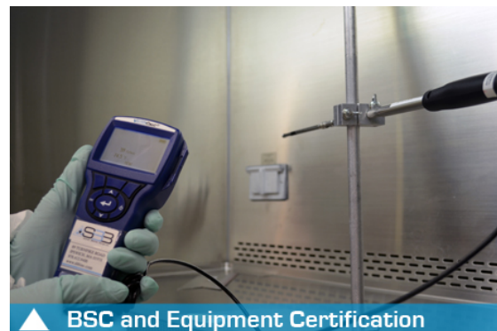
▲ BSC and Equipment Certification

HEPA Integrity, ISO and EU Particle Counts, Air Change Rates, Viable Environmental Sampling, Room Pressure Testing and certifications and Room Recovery Testing and certifications. As built, at rest, and operational. Pre and post construction certification.